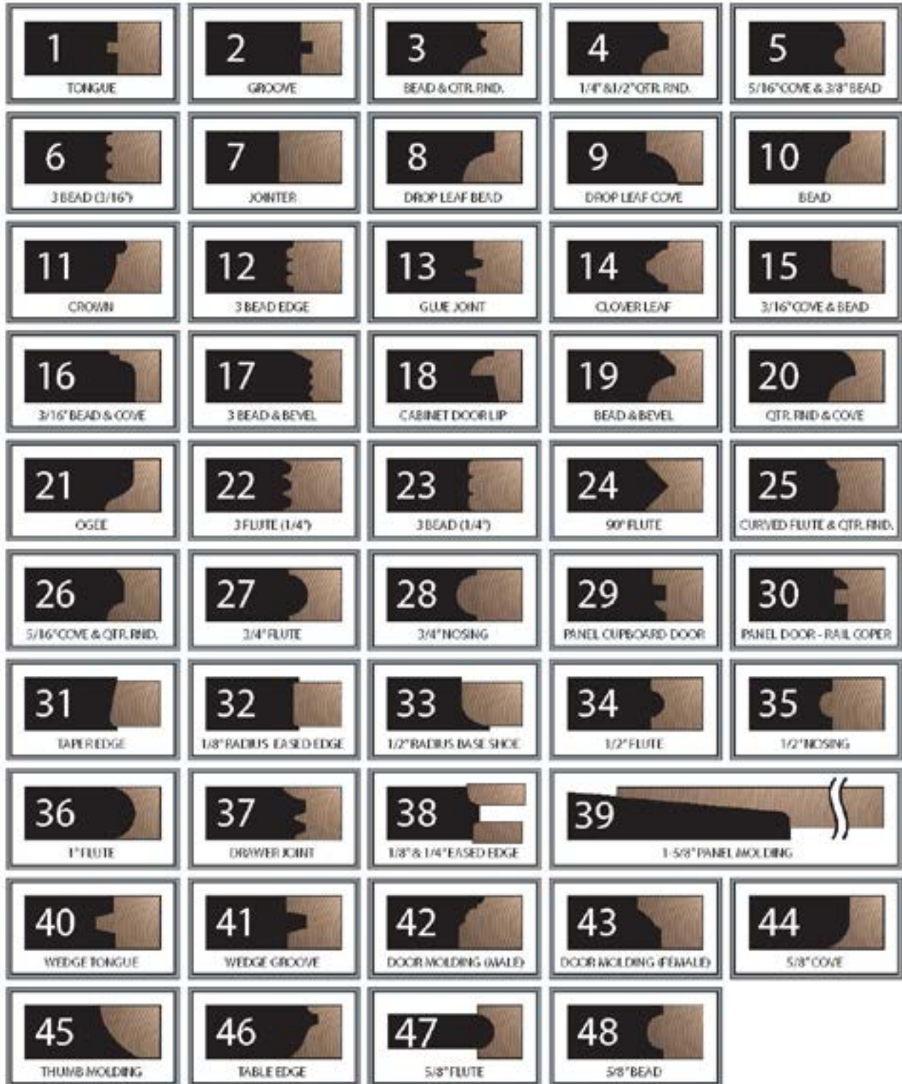
Table Saw Cutter Profile Chart